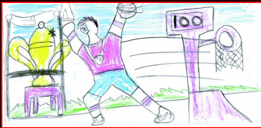
Trevor Gwatida in Room 1 is a wonderful artist. Look at his cool picture about sports day. Keep drawing Trevor!!